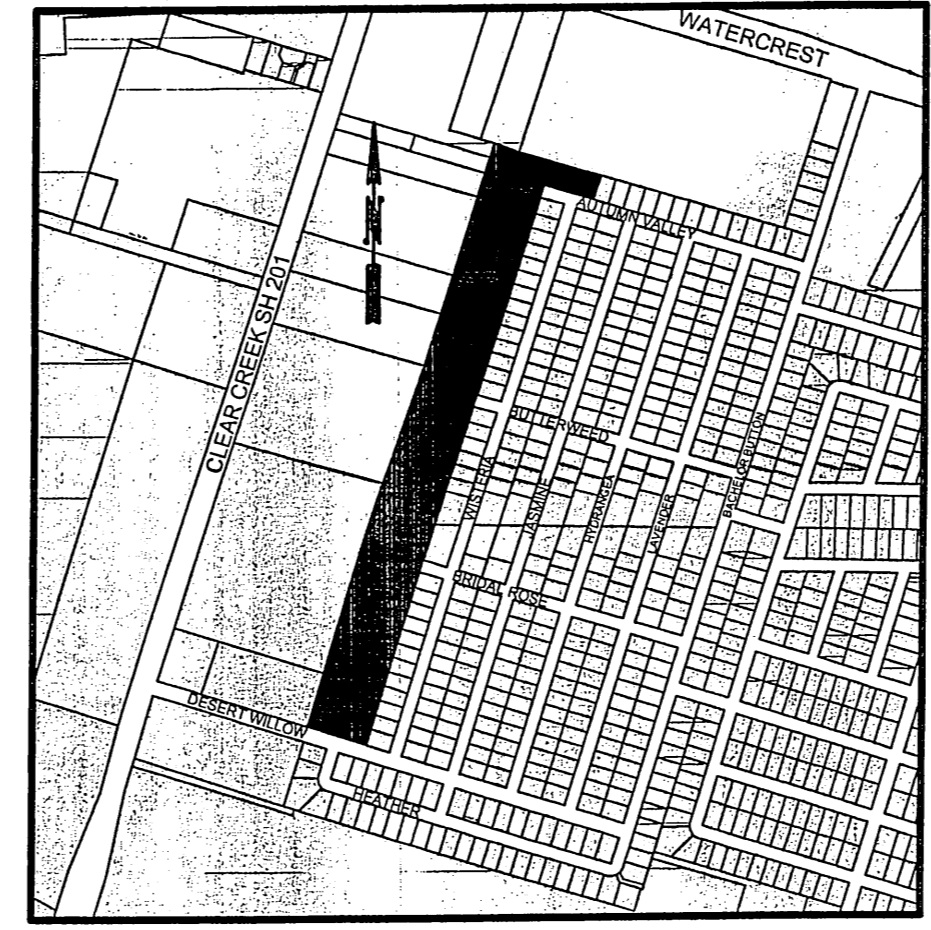
VICINITY MAP N.T.S.

REFERENCE BEARING PER DEED S 71°11'20" E - 528.50'