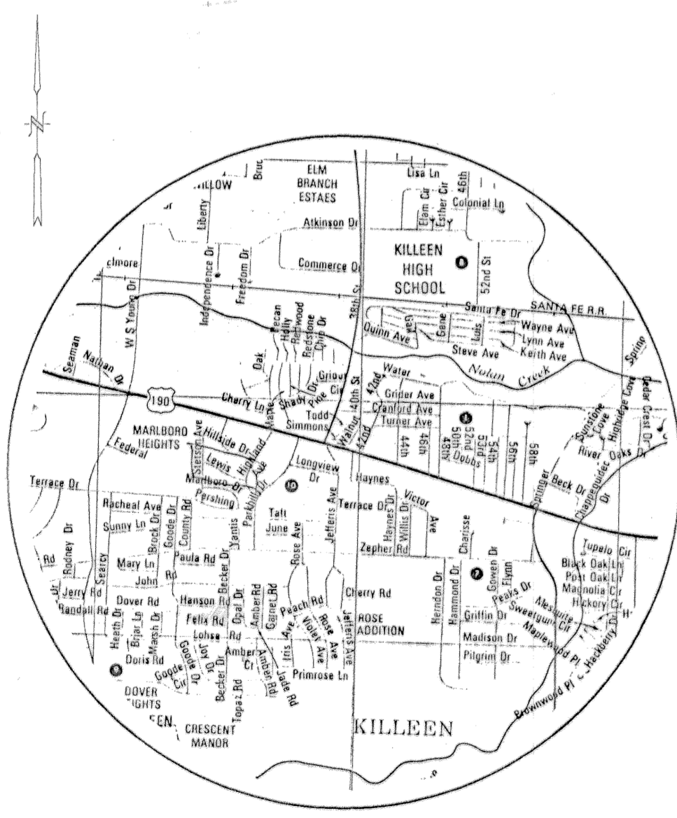
VICINITY MAP - NOT TO SCALE