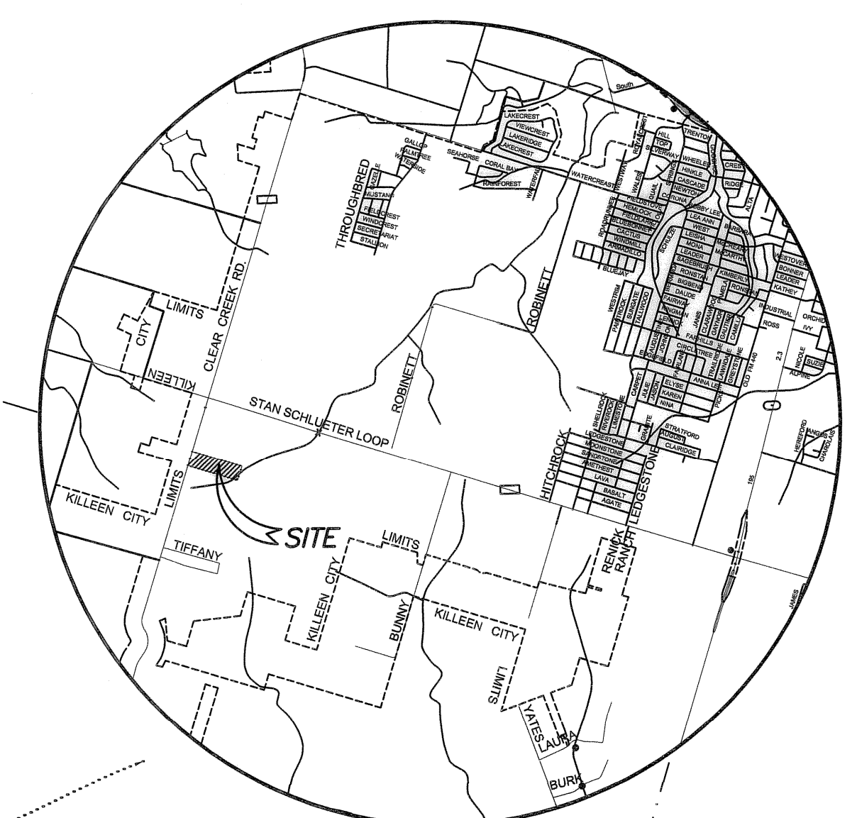
VICINITY MAP NTS