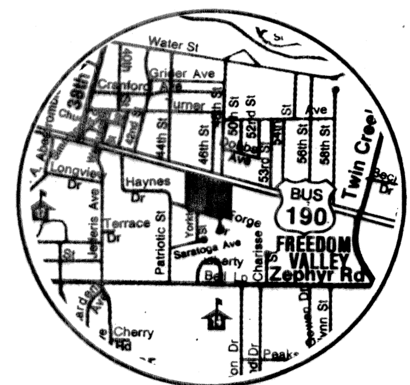
VICINITY MAP N.T.S.