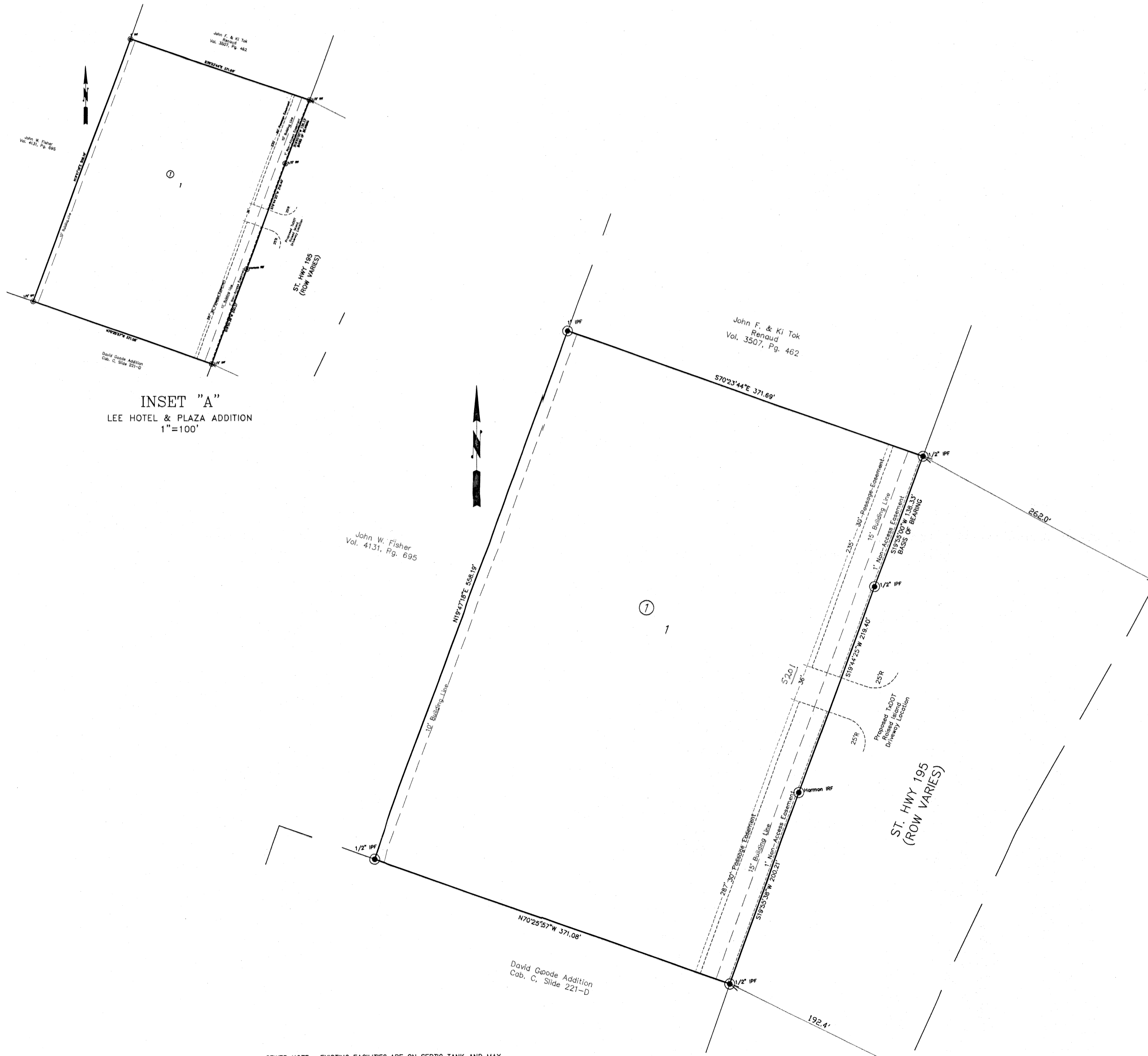
INSET "A" LEE HOTEL & PLAZA ADDITION 1"=100'

SEWER NOTE: EXISTING FACILITIES ARE ON SEPTIC TANK AND MAY REMAIN, SO LONG AS THE CURRENT SEPTIC TANK REMAINS FUNCTIONAL. CURRENT SEPTIC TANK SHALL NOT BE REPLACED OR MODIFIED AND ANY FUTURE FACILITIES MUST BE ON SANITARY SEWER.